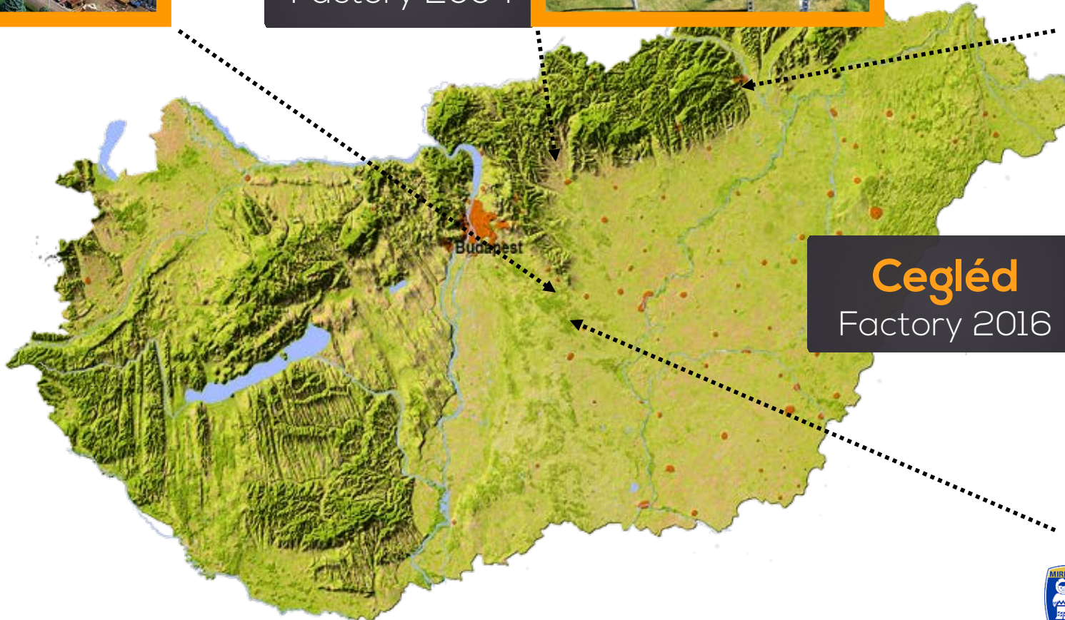
Cegléd Factory 2016