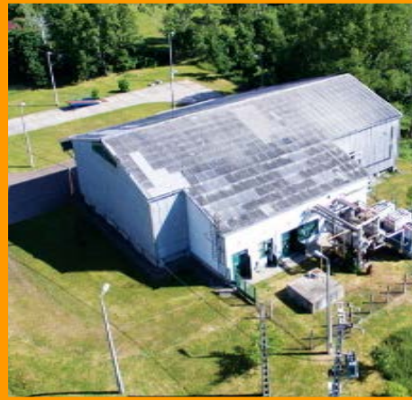
Domoszló Factory 2004