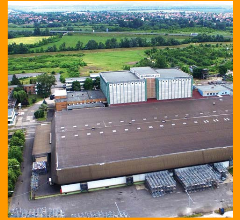
Miskolc Factory 2006