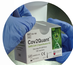
Cov2Quant™ SARS-Cov-2 Quantification kit