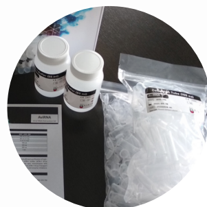
AviRNA viral RNA extraction kit