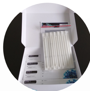
ATM-1 sampling device